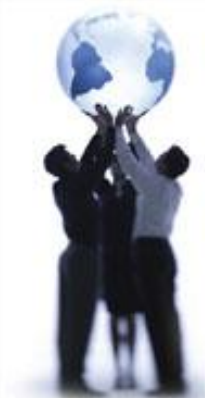
Evolve to Simplicity